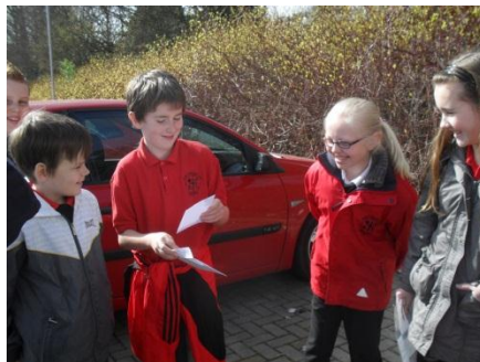
Kirkcaldy Map Trail